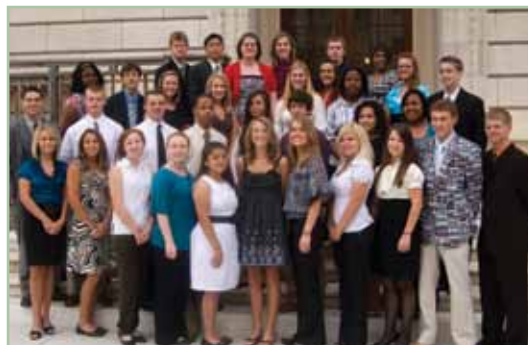
2009 Rural Electric Youth Tour participants pose in front of the Cannon House Office Building in Washington, D.C.

The Rural Electric Youth Tour is a joint effort of local electric co-ops, such as Edgecombe-Martin County Electric Membership Corporation, statewide co-op associations and the National Rural Electric Cooperative Association in Arlington, Va.