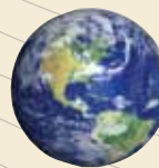
Lines from the CEO: Climate-Change legislation pushes forward.