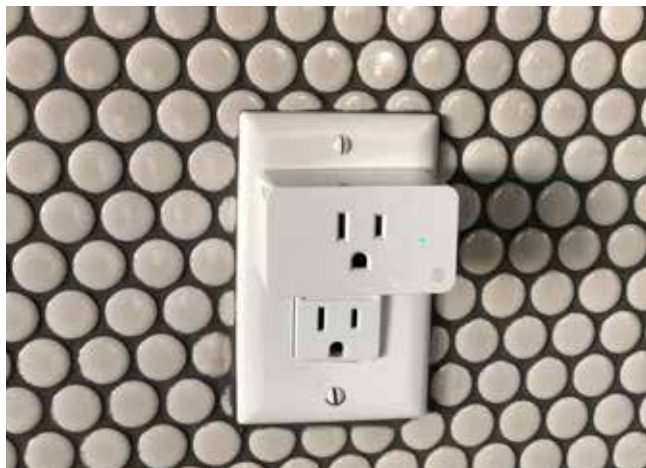
Smart plugs are a great starter option and allow convenient control of lamps or other lighting fixtures that are plugged in to a wall outlet.

If you're looking to take the plunge and integrate multiple smart bulbs to your home lighting system, your