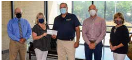
Nash Community College Check Presentation

enrolled in the NCC and MCC Electric Line Construction program and the engineering or electrical program at ECC.