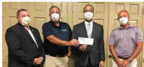
Edgecombe Community College Check Presentation