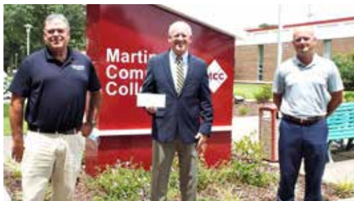
Martin Community College Check Presentation