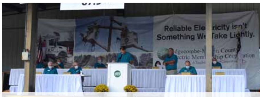
2020 Annual Meeting Business Session

For members of Edgecombe-Martin County EMC