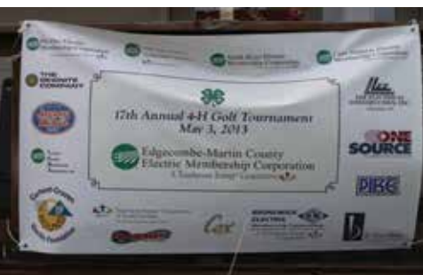
The 2013 4-H Golf Tournament netted $5,000 for the Edgecombe County 4-H. Cox Industries was the winner of the 2013 tournament.