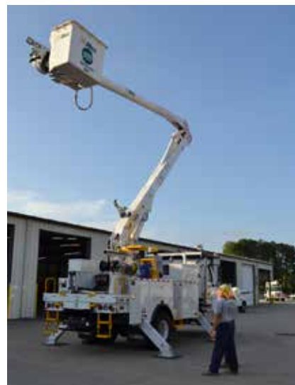
Preflight check on truck

In a perfect world, this is one skill that you hope a lineman never needs to use. But if they do, the training is an opportunity for the linemen to prepare and hone their skills if the need should ever arise.