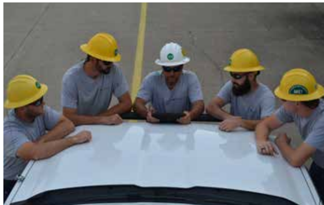
Safety meeting tailgate performed at every jobsite