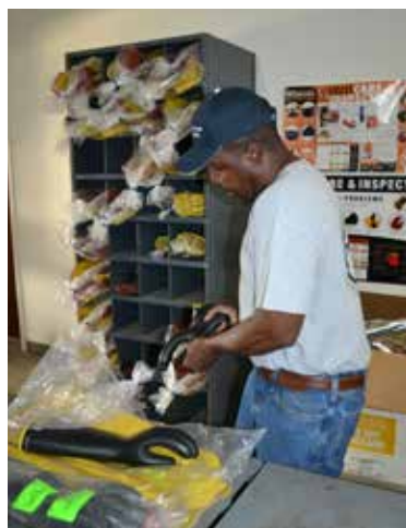
Daily glove inspections

balance their skills with safety, climb a pole and rescue a 185-pound training mannequin. The lineman must then secure the mannequin using ropes and pulleys and safely deliver them back to the ground.